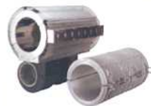
Cast-In Shroud Systems