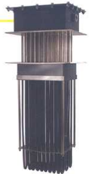
Horizontal Mounted Circulation Heater with Power Control Panel