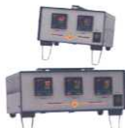
Temperature Control Consoles