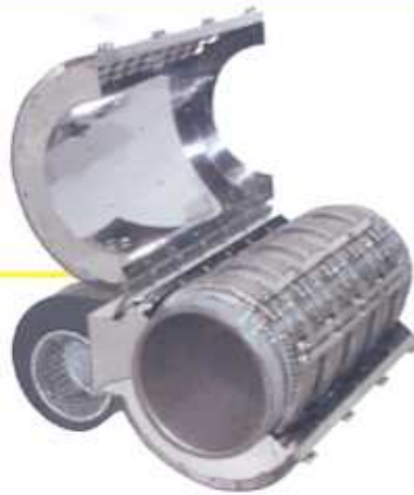
Cool TO-THE Touch™ Extruder Heating & Cooling Shroud System