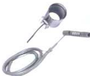
Coil & Cable Heaters