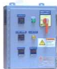
Power Control Panels