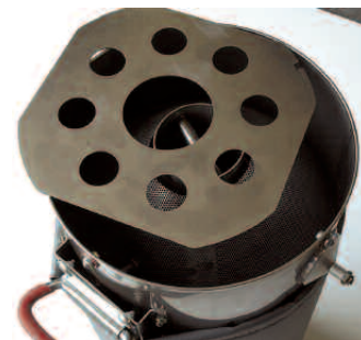
Easy access to all parts of canisters for on-the-fly material change and cleanout.