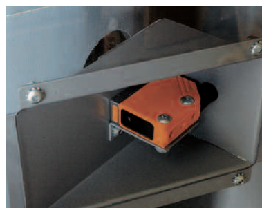
High-level sensor monitors intake of material and eliminates over-filling of canister.