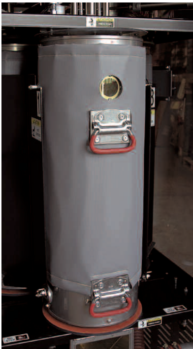
Small canisters facilitate quick heating of resin and are easily removable for on-the-fly changes of colors or resins.

Simple operation - All dryer functions and alarms are easily programmed... even by inexperienced personnel.