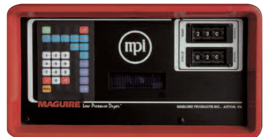
Simple control can be easily programmed and can be set to alarm when material change is due.