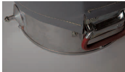
The edges of the canisters are now rolled to eliminate sharp edges and add strength.