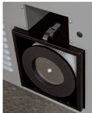
Easy access to air filter.